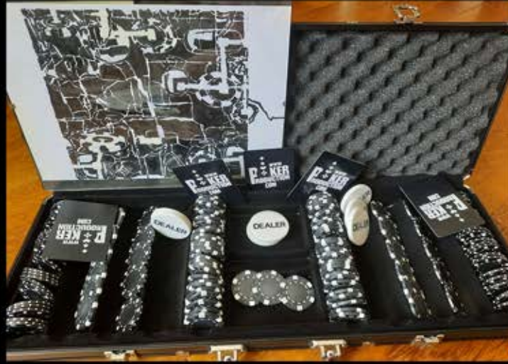
Black metal poker chip case Black and white chips. Modiano poker cards. Poker Dealer chips Black and white drawing related to the paintings on canvas and the projected image