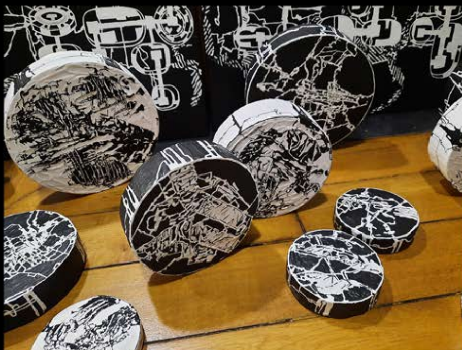
3 acrylic paintings on cotton canvas (50x100cm) 34 round styrofoam discs with various dimensions (10cm, 15cm, 20cm, 25cm) White Gesso. Acrylic paintings (black, white). Acrylic markers (white, black)